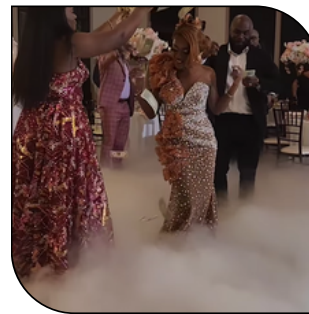
DANCE ON CLOUD - $350

Choice of static or animated design. Setup from the ceiling for a clean, stand free design