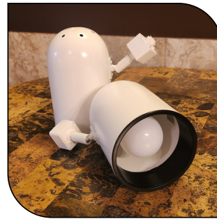
SPOT LIGHTS $10 EACH

Our waitstaff can help serving, replenishing, bussing tables, cutting cake and more. Additional hours @$30/hr