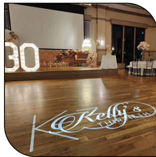
PROJ'D MONOGRAM $300-$350

Photography experience, where memories are not just captured but delivered instantly! Imagine your guests arriving, effortlessly registering, and then receiving their beautifully taken photos within minutes.