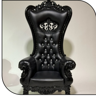
THRONE CHAIRS $175