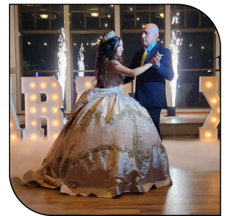
COLD SPARKLERS $2,000 - $2,250

Includes effects tech, dry ice, licensing & insurance