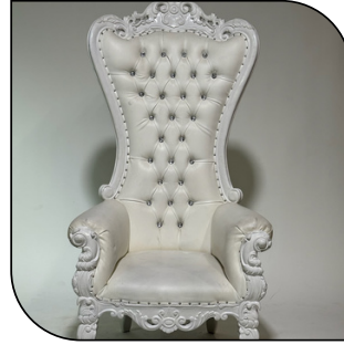
THRONE CHAIRS $175