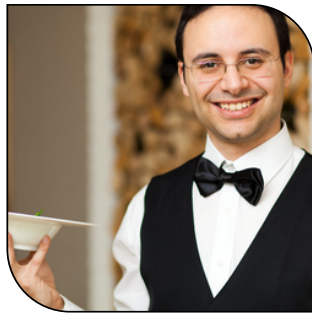
WAITSTAFF $30/HR PLUS $100 BOOKING FEE

TABC Licensed with Liquor Liability Insurance Will require booking additional hrs for setup/bkdwn