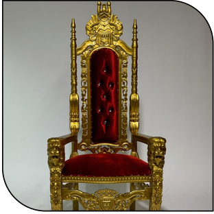
THRONE CHAIRS $175

However we have some amazing add-on items that can elevate your event and can help fill in the gaps you are not finding with your own vendors.