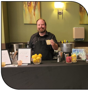
BARTENDERS $45/HR PLUS $125 BOOKING FEE

TABC Licensed with Liquor Liability Insurance Will require booking additional hrs for setup/bkdwn