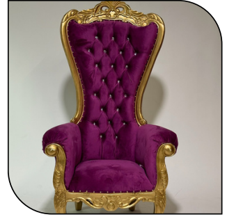
THRONE CHAIRS $175