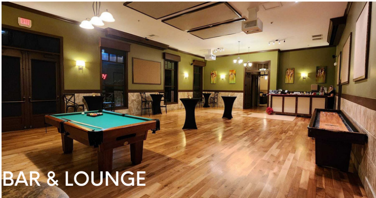
BAR & LOUNGE

Elegant & versatile hall with tall windows that can serve as an beautiful indoor ceremony site for up to 120 ceremony style and/or to setup up to 3 double buffet lines.