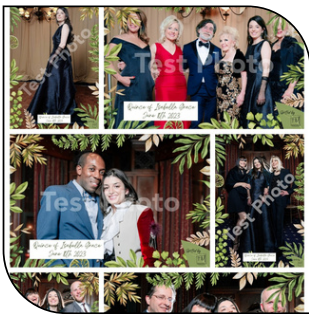
INTERACTIVE PHOTOGRAPHY $250/HR (4HR MIN)

Add up to (10) uplights to your backdrop or around the room