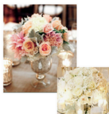
4-8 Roses or Peonies 3-5 Hydrangeas 1 to 1 ½ bunch of fillers 2-4 Candles (floating or votive) Medium Base