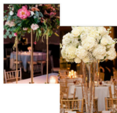
9-18 Roses or Peonies 6-9 Hydrangeas 2 to 3 bunch of fillers 2-4 Candles (floating or votive) Tall Vase