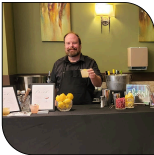
BARTENDERS $45/HR PLUS $125 BOOKING FEE

TABC Licensed with Liquor Liability Insurance Will require booking additional hrs for setup/bkdwn