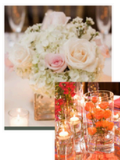
2-4 Roses or Peonies 1-2 Hydrangeas ½ bunch of fillers 2-4 Candles (floating or votive) 1-3 Small Vases