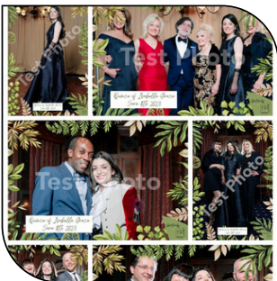
INTERACTIVE PHOTOGRAPHY $250/HR (4HR MIN)

Add up to (10) uplights to your backdrop or around the room